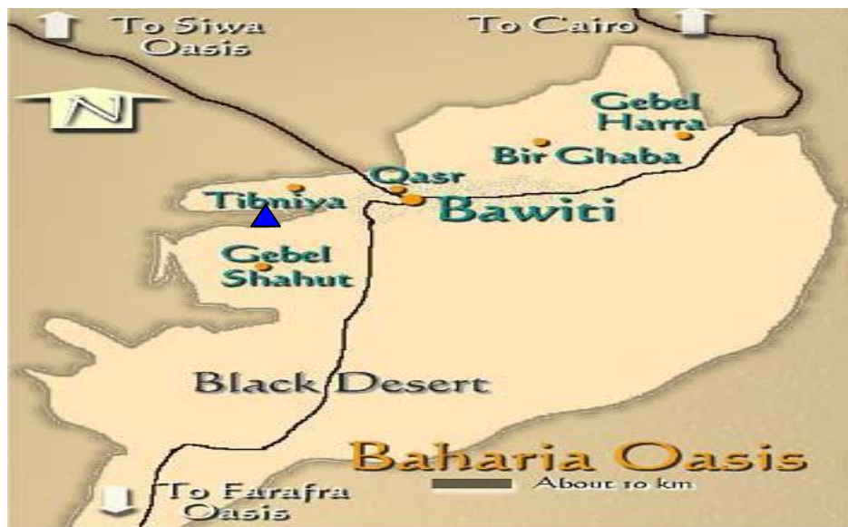
Map 2. Distribution of the parasitoid, Comperiella lemniscata in Baharia Oasis