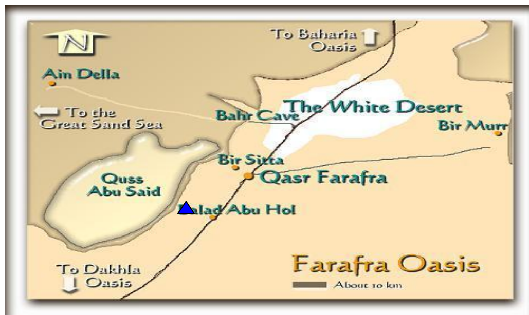
Map 4 Distribution of the parasitoid, Comperiella lemniscata in Farafra Oasis