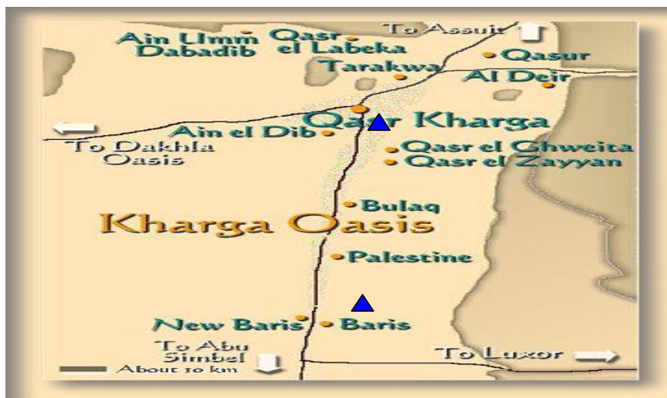
Map 5 . Distribution of the parasitoid, Comperiella lemniscata in Kharga Oasis