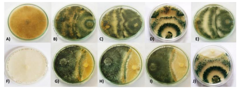
Fig 3. Antagonistic effect of Pb-7, Pb-10, MYT-75 and BSMRAU-1 of T. harzianum respectively, against virulent isolates of R. solani (B-E) and of S. rolfsii (G-J) where (A & F) are control.