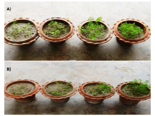
Fig. 1: Pathogenicity test of A) R. solani (R-1, R-2, R-3) isolate and control from left and B) S. rolfsii (S-1, S-2, S-3) isolate and control from left on carrot seedlings grown in pot.

* Mean values within the column having the same letter do not differ significantly.