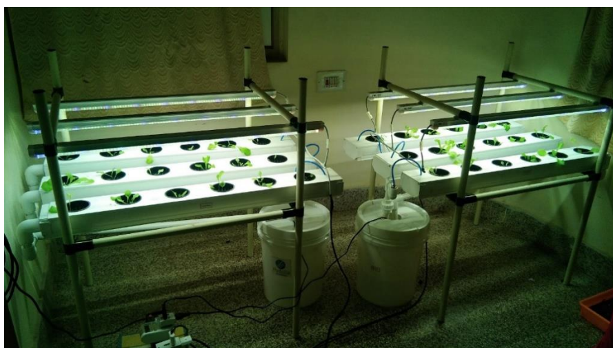
Fig. 1. NFT setup of lettuce plants grown hydroponically (control and pranic)