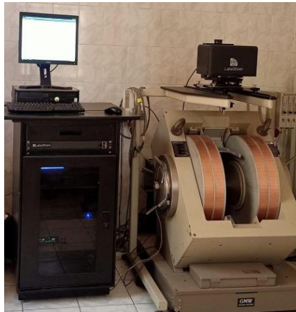
Fig. 1. Vibrating Sample Magnetometer apparatus

The experiment was conducted during the spring 2024 at the Sericulture Research Department, Plant Protection Research Institute and Biotechnology Laboratory, Regional Centre of Food and Feed, Agricultural Research Centre, Ministry of Agriculture. The experiment was conducted by the Lake shore Vibrating Sample Magnetometer software apparatus.